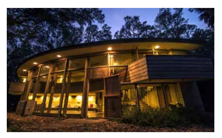
The floor to ceiling windows on the east side of the Lewis House. Growing up in the house, Byrd Lewis Mashburn said that these windows and the open feeling in the house, "just drew you outside."

A circular terraced area was established on the east side and north end of the exterior. However, a low block wall intended to enclose the terrace and a semi-circular pool were never completed.